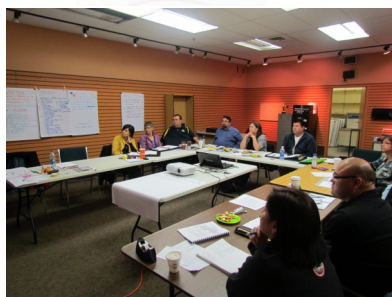
New Boardroom at Games Office in Gateway Mall