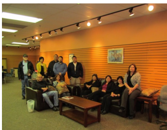
Reception area as committee members pose for a quick picture on the furniture donated by Leon's Prince Albert.